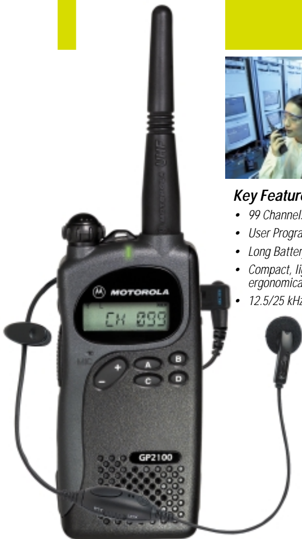
Radio shown with PMLN4442